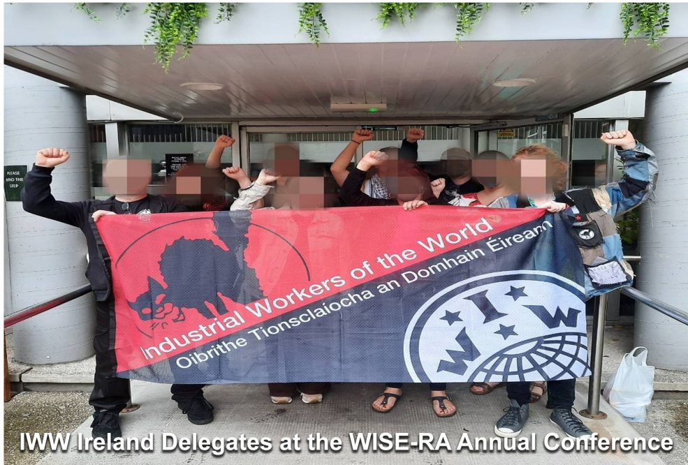
IWW Ireland Delegates at the WISE-RA Annual Conference

IWW delegates were overcome with joy to attend the 2025 IWW conference in Edinburgh. The packed schedule over the three-day event saw discussion of and voting on several internal motions along with reports from the internal sections and a range of interesting talks.