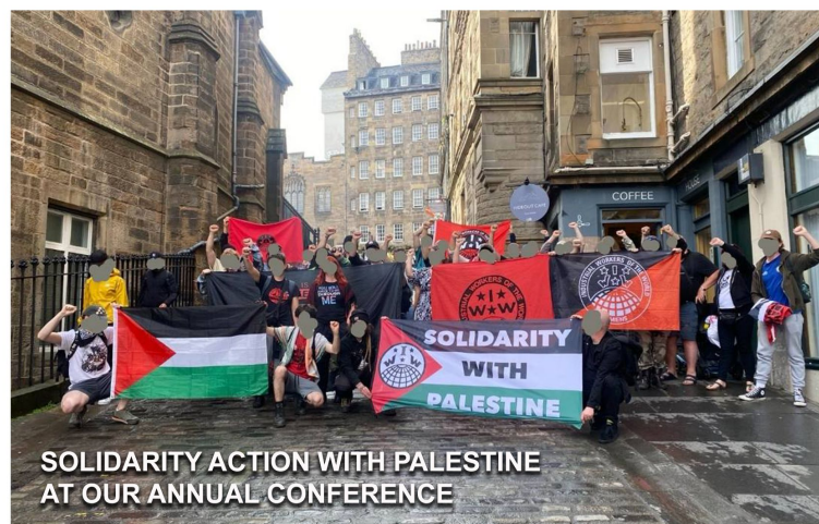
SOLIDARITY ACTION WITH PALESTINE AT OUR ANNUAL CONFERENCE