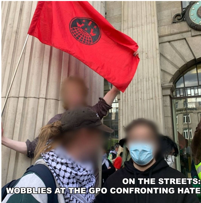
ON THE STREETS: WOBBLIES AT THE GPO CONFRONTING HATE

Among all the unions that exist today the IWW has a unique connection to its origins. On the 1st of May 1886 Lucy and Albert Parsons led a march through the streets of Chicago to demand the eight hour working day. This formed part of a wider struggle including strikes and rallies that had been met by repressive violence, including workers being shot and killed by police. A rally followed on the 4th of May condemning the killings by police. This day would become known as the 'Haymarket Affair'.