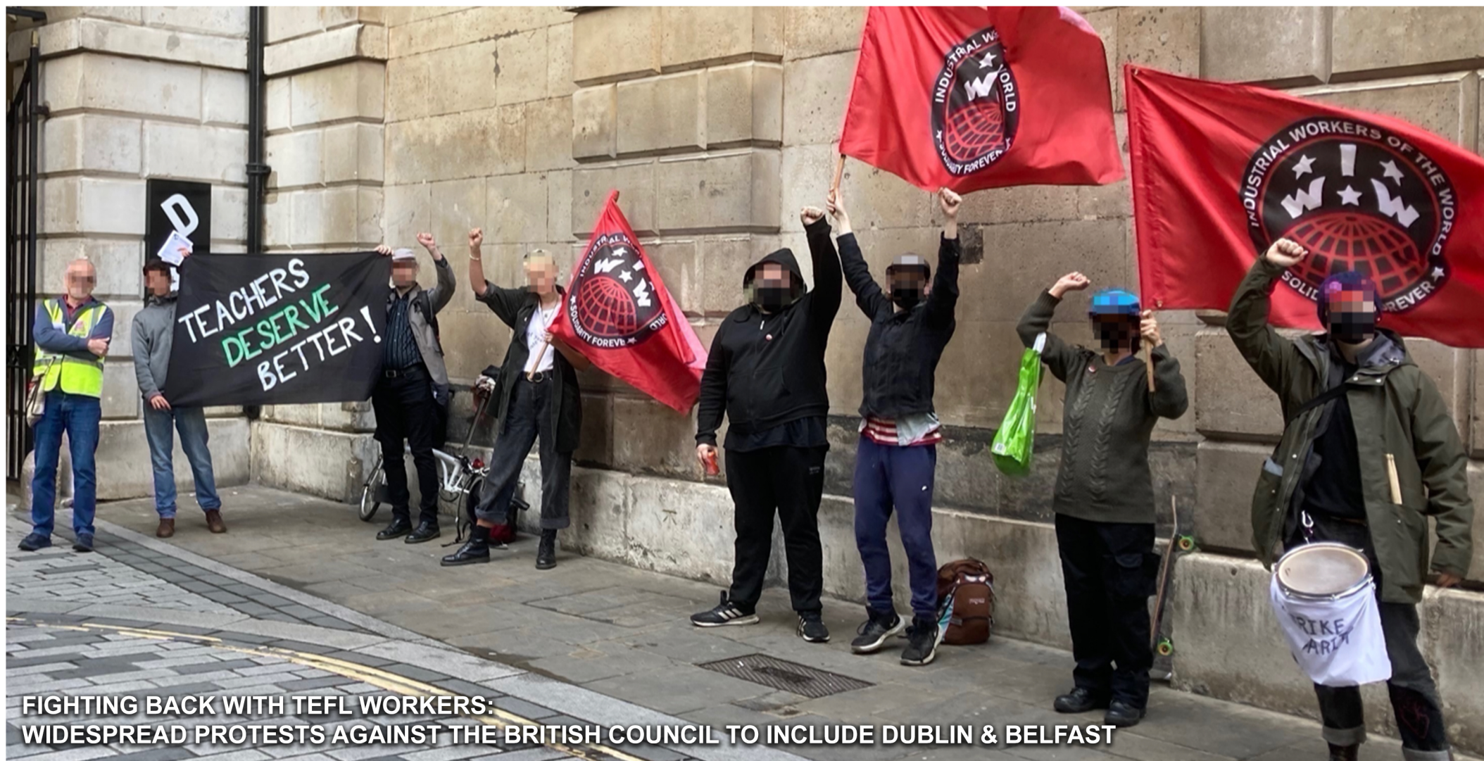
FIGHTING BACK WITH TEFL WORKERS: WIDESPREAD PROTESTS AGAINST THE BRITISH COUNCIL TO INCLUDE DUBLIN & BELFAST

The TEFL Workers' Union is again in dispute with the British Council and their outsourcing agency, Impellam, over the alleged dismissal of a whistleblower. The union alleges that the worker was fired after raising health and safety concerns related to the scheduling system.